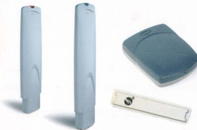
(B) Ultra-Shield Dual + Versa Pass Table top + 5,000 AM Label