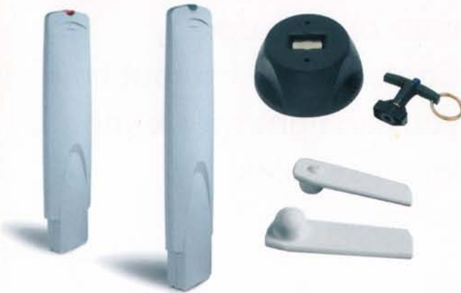
(A) Ultra-Shield Dual + Detacher with lock + 1,000 AM Hard Tag